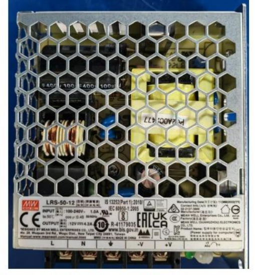
Taiwan MW(MeanWell) switch