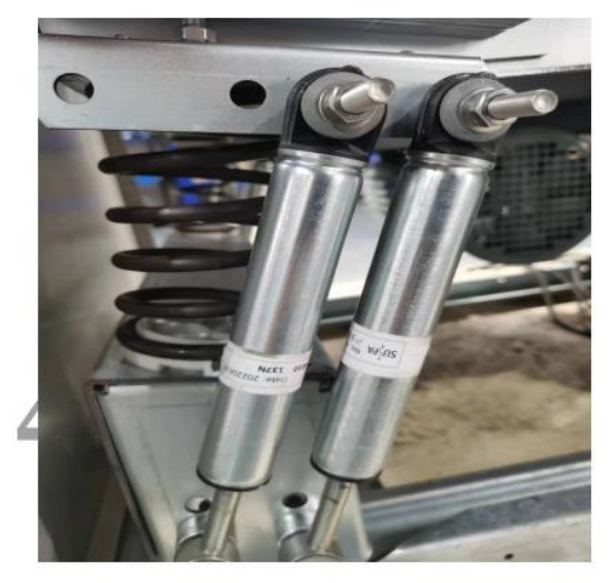
Germany SUSPA damper