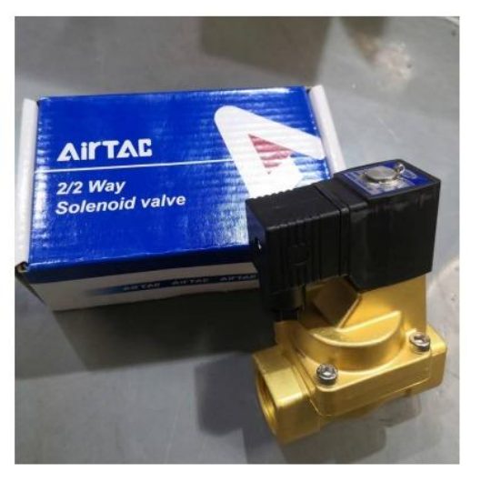
AIRTAC solenoid valve